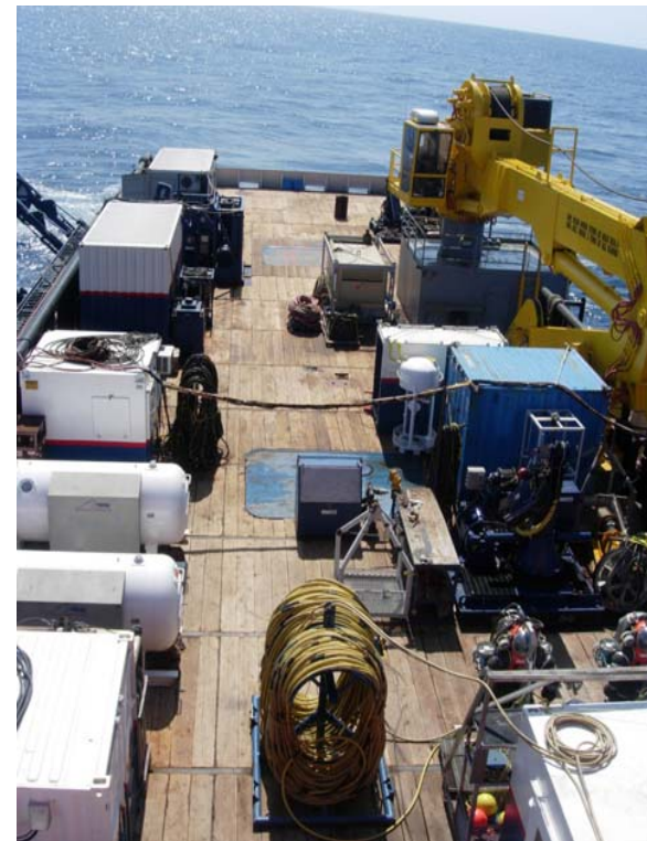
Onboard Spreads Supporting Manned and Unmanned Inspection, Maintenance, and Repair Services