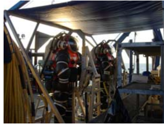
Atmospheric Diving System 1,200 fsw