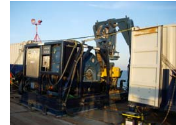
Remotely Operated Vehicle 20,000 fsw